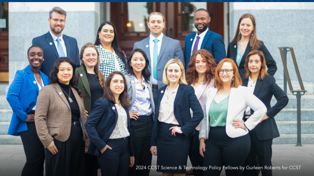
2024 CCST Science & Technology Policy Fellows

LEGISLATIVE & EXECUTIVE BRANCH Placements